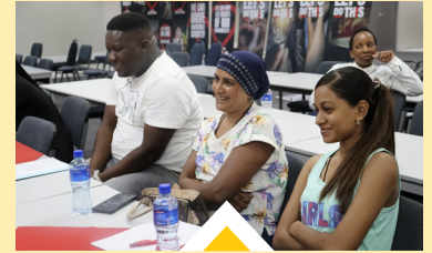
Informal food traders in Phoenix received training on health and safety measures from the City's Health Unit as part of an ongoing campaign.

INFORMAL food traders from Phoenix gained knowledge on food safety and hygiene through a workshop hosted by the City's Health Unit. EThekweni is home to many informal traders who have made a massive contribution to the City's economic growth. As part of an ongoing initiative aimed at promoting food safety and hygiene, the campaign strives to ensure that informal traders have the knowledge to adhere to safety regulations while expanding their businesses.