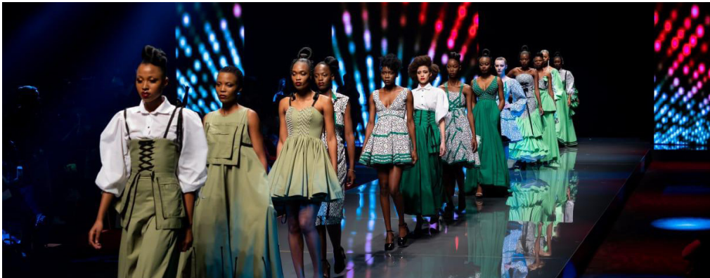
Several events were held in the City over the long weekend including the National Heritage Day celebration at Princess Magogo Stadium in KwaMashu and the Durban Fashion Fair.

DURBAN experienced a bumper long heritage weekend from 22 to 25 September with an influx of visitors to the City attending various annual calendar events.