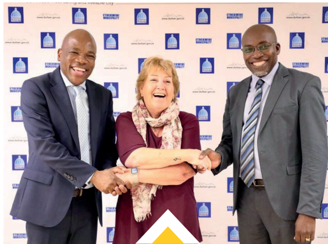
A successful engagement between the City and the uMhlanga Ratepayers and Residents Association was held, where a plan of action to address service delivery challenges was discussed.

Other issues raised included sewer spillages and the malfunctioning of the Ohlange Pumpstation as well as the construction of the public transport facility for buses and taxis around the uMhlanga Oceans Mall. She said these