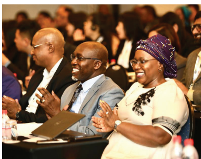
More than 50 delegates from Brazil, Russia, India, and China attended the BRICS Trade and Investment Seminar.

TO FURTHER position KwaZulu-Natal as a gateway to Africa and the world, around 50 delegates from Brazil, Russia, India, China, and South Africa attended the BRICS Seminar on Trade and Investment on 17 and 18 August at the Elangeni Hotel in Durban.