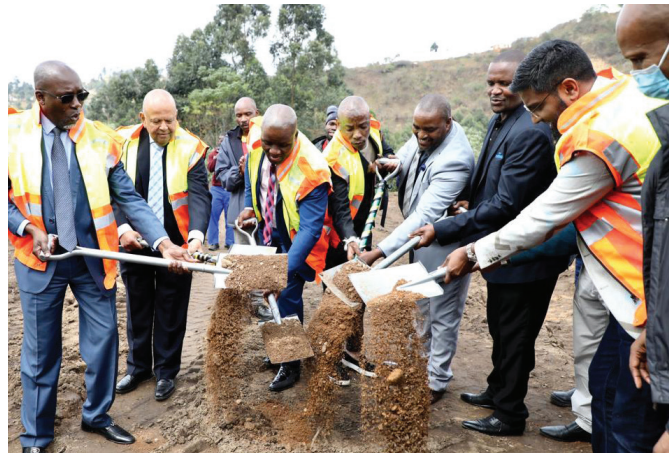
Minister of Public Enterprises Pravin Gordhan and eThekweni Mayor Councillor Mxolisi Kaunda are joined by Economic Development Chairperson Councillor Thembo Ntuli, Ward 15 Councillor Thembelani Shezi and Giba Business Estate developer Shaaz Moosa at the sod turning ceremony of the Giba Business Estate.

Minister Gordhan reiterated that it is incumbent on government to make it as easy as possible for businesses to invest. He urged government