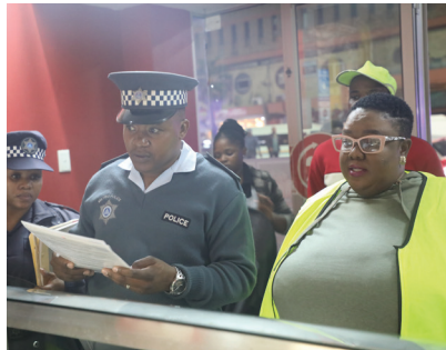
EThekwini Deputy Mayor Councillor Zandile Myeni led a business compliance blitz in the South Beach and Mahatma Gandhi Road vicinity.