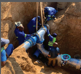
A pipeline upgrade to improve water supply in KwaNyuswa is at an advanced stage.

A PIPELINE upgrade to improve water supply in KwaNyuswa is at an advanced stage. The upgrade aims to augment the existing pipeline that receives water from the Thandokuhle Reservoir. The current pipeline no longer has enough capacity to supply the entire community due to increased demand for supply.