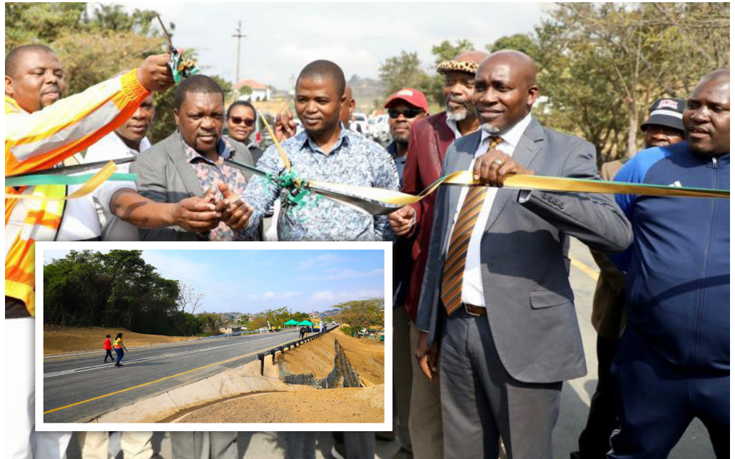
MEC for Transport, Community Safety and Liaison Sipho Hlomuka presided over the reopening of the R603 in Adams Mission, together with eThekweni Mayor Councillor Mxolisi Kaunda on 14 August.

The re-construction of the damaged section of the R603 was among the first projects that MEC Hlomuka attended