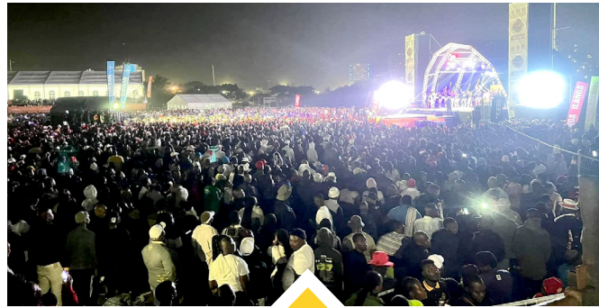
The 10th annual Impucuzeko Maskandi Festival hosted in eThekweni recently was a resounding success.