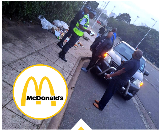
The Metro Police acted swiftly to fine the manager at McDonalds on KE Masinga Road for illegal dumping.

The swift action by Metro Police officers led to the