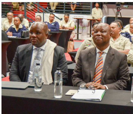
Chairperson of the Economic Development and Planning Committee Councillor Thembo Ntuli and MEC for Agriculture and Rural Development Super Zuma.

THE City was the proud host of the Provincial Annual Extension Summit which took place on 28 July at the Olive Convention Centre themed 'Towards building an inclusive, adaptive attitude for sustainable food systems: The role of agricultural extension'. The summit provided an opportunity for agriculture sector stakeholders to present their goals and objectives on how they manage the development of crop, livestock, and aquaculture production programmes in order to transform the agricultural sector and improve food security. Some of the topics covered included the impact of the multi-crop season to address food insecurity in rural communities, improving rural economies through beef production, technology transfer, and the role of extension services, to name a few.