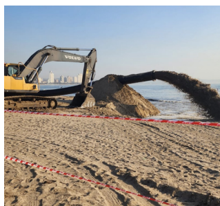
eThekweni Municipality is pumping sand onto the beach as part of the process to keep its beaches pristine. Contrary to recent reports, this is not sewerage being pumped. Foam is created because of turbulence in the sea that churns up natural substances.

This also acts as a buffer between the beach and infrastructure. The harbour breakwaters prevent the natural migration of sand from south to north on the beachfront necessitating the sand pumping operation. If the City did not pump sand, the beaches would erode away with the action of the waves. Continuous beach monitoring programmes are in place to provide sediment data on the beaches. Read an article about this on the SAAMBR website for clarity. https://www.saambr.org.za/what-is-that-foamy-stuff-on-the-beach/